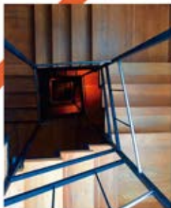
Stairs leading to the various floors.