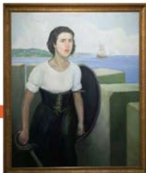
Maria Pita. Francisco Lloréns, 1944.