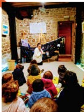
Educational activity in the temporary exhibition room.