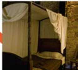
Recreation of the bedroom.