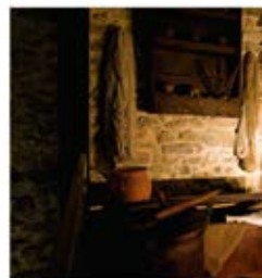
Recreation of the family kitchen