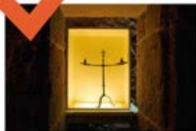
Wrought iron cross with 2 arms in the form of a Greek cross.